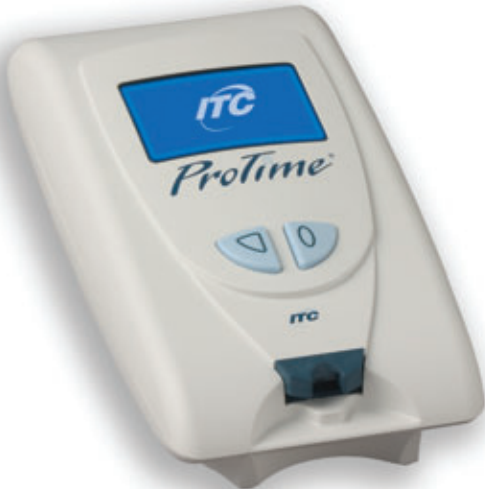
CLIA Waived PT/INR

Import PT/INR results into CoagClinic, the leading anticoagulation management software