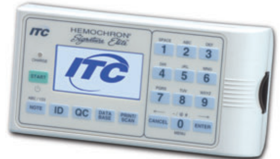
Moderately Complex PT/INR

Results are instantly displayed in CoagClinic from the ITC ProTime® or HEMOCHRON® with just one click!